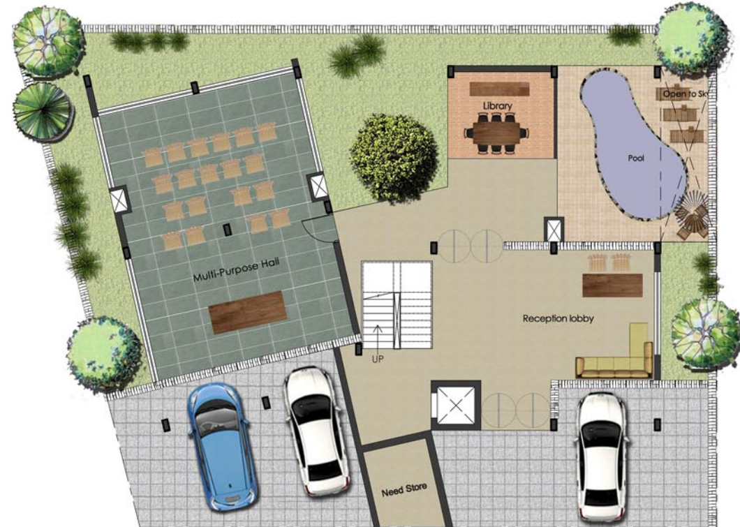
Stilt level Plan

12 Exclusive studios nestled in Mendelevium development designed for stay and leisure, with furnishing and complimenting amenities.