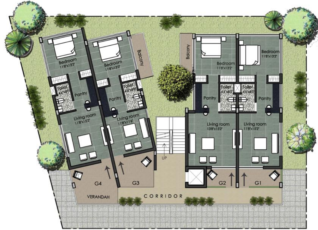
Typical Plan (1 st & 2 nd Floor)

G1 SBA: 820 G2 SBA: 842 G3 SBA: 765 G4 SBA: 832